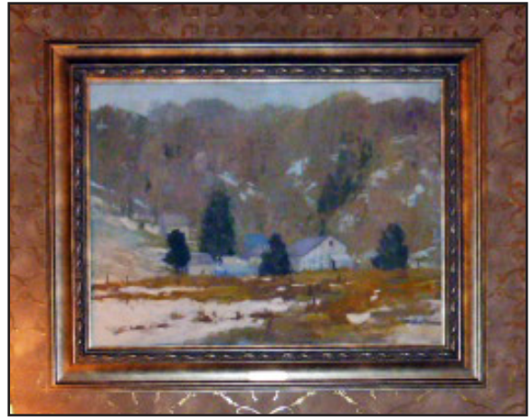
▲ One of the paintings on display in the hotel lobby

Organizers are hopeful that all art lovers will enjoy the partnership of the Masters of Indiana Art and the Masters of Indiana Architecture. More plans are in the works that include the opening of a gallery in the rotunda of the hotel and some special events to take place later this summer, including a paint out and reception at the hotel on August 20, 2011. In the meantime, the paintings will be rotated on a regular basis.